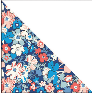
HALF SQUARE TRIANGLE

(8 Half Square Triangles will not be used.)